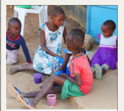
preschool students having porridge