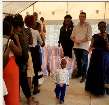
Kitengela food distribution