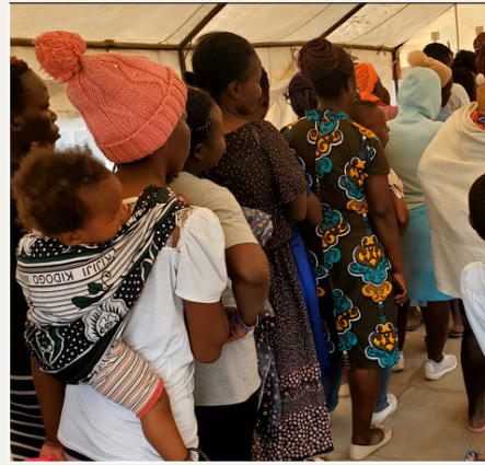
Kitengela food distribution

Lastly, this year in the midst of unprecedented hunger due to prolonged draught in the country and biting inflation. With your support we were able to provide a week's worth of food to over 200 single mothers.