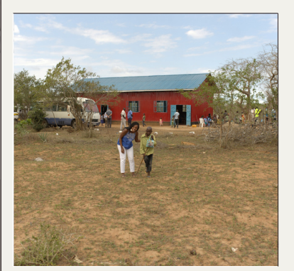
2021 Visit to Kenya Before