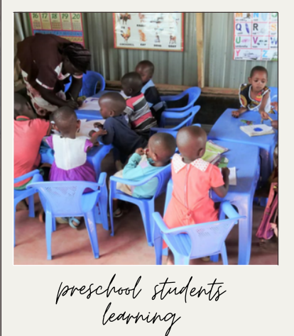
preschool students learning