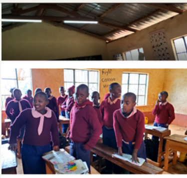
provided electricity for eight classrooms