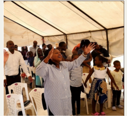
New Tents at Kitengela