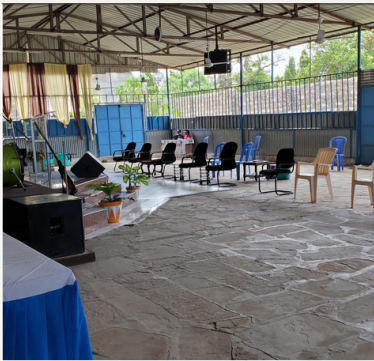
Church renovations before