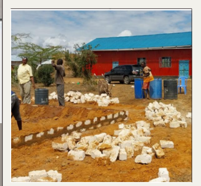
First grade classroom being built october, 2022