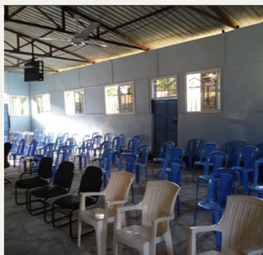
Church renovations after