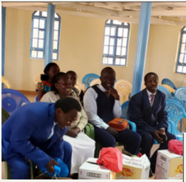
Food for pastors

This year with your support we were also able to install electricity in 8 classrooms, a computer room and an office block at Yakamete Primary School. This school is over 60 years old and did not have electricity in the classrooms.